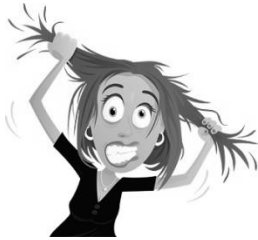
“The Overscheduled Parent”