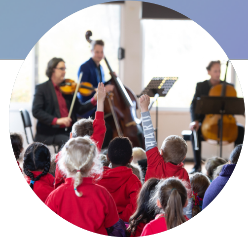
Other Arts Organizations

Partnerships are important for expanding our reach and making a bigger impact.