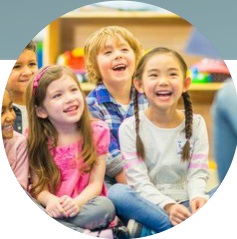
Schools and Churches