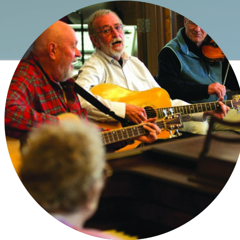
Senior Centers, Community Centers