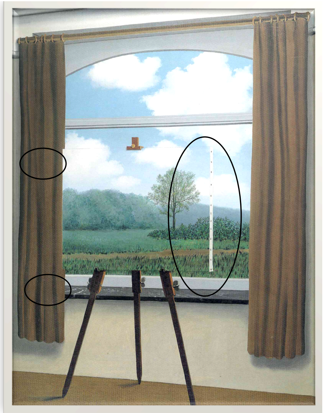
The Pedals As Tonal Resource – Frederic Chiu – Pedagogy Saturday MTNA 2018

The smallest details can set the expectations and interpretation for a vast space.