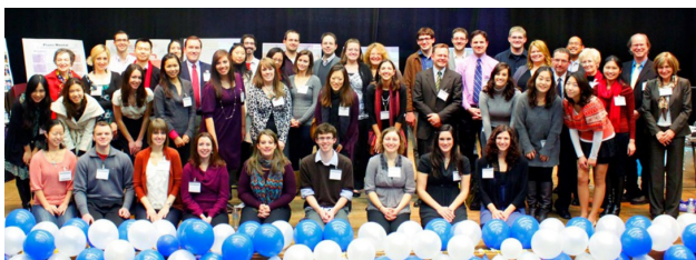
Inaugural Collegiate Symposium

This weekend we encourage you to take advantage of all the opportunities for learning new skills, building a professional network and renewing your spirit. Everything you do, every speaker you hear, every session you attend, will present you with a challenge and an opportunity, so keep your minds open to what you hear and see. In doing so, you'll become a better student and a more skillful music teacher.