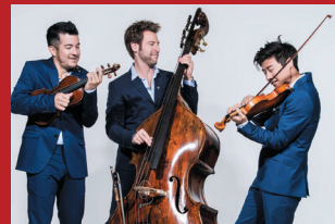
Time For Three

For more information, visit www.mtna.org